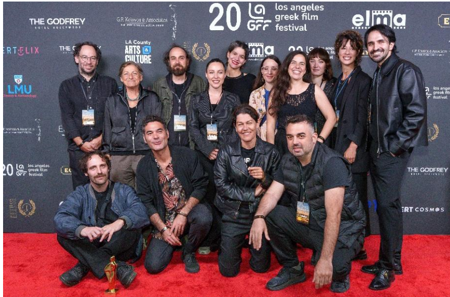
Discovery Days Filmmakers & Team