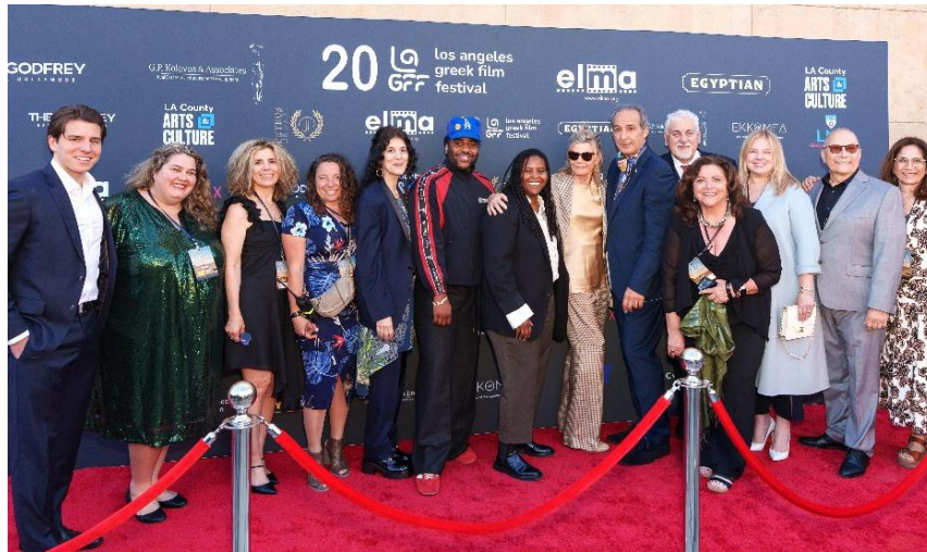
Honoree Alexandre Desplat Red Carpet Arrival

LOS ANGELES, CA – (June 4, 2026) - The 20 th Los Angeles Greek Film Festival (LAGFF) drew to a close this weekend capping off a week of cinematic excellence, red carpet events, and memorable tributes. The Closing Night Film & Orpheus Awards Ceremony at the Egyptian Theatre on May 31 were presented in collaboration with the American Cinematheque. The virtual film program continues through June 14.